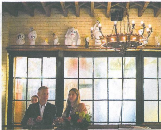
A Details magazine party at Dirty French, the restaurant in the Ludlow Hotel.

Ninety stories tall and devastatingly thin, the new Park Hyatt is an icicle of anonymity staked across from Carnegie Hall. The lower 25 floors are devoted to a hotel and ancillary amenities: pool, restaurant,